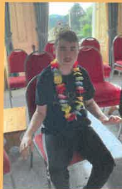
Hérons visited the Madhyamaka Kadampa Meditation Centre in Pocklington for a day of mindfulness and reflection.

The Buddhist nun led the pupils in a re-enactment of the story of Buddha. They stayed respectful and mindful during the Mantra Recitation - with each pupil achieving stillness and quiet. They took their learning from the visit and put it into practice back at school in their own yoga session.