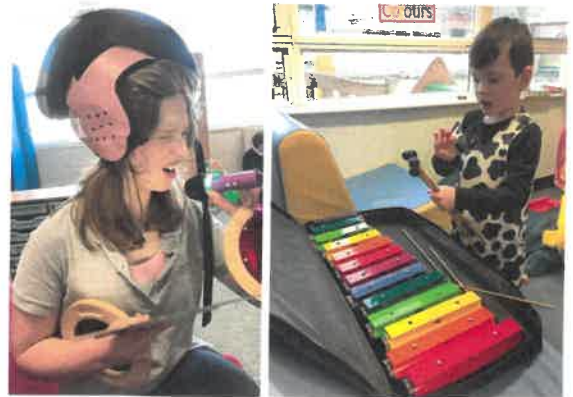
'The school environment is calm and purposeful. Laughter and music can be heard through the corridors' (Ofsted 2023)