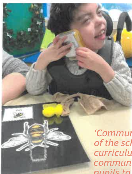
'Communication sits at the heart of the school community and the curriculum. Staff use a range of communication tools to support pupils to connect' (Ofsted 2023)