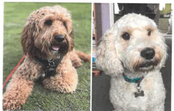
'The school dogs are a crucial support tool for pupils to understand cause and effect and to experience positive social responses' (Ofsted 2023)